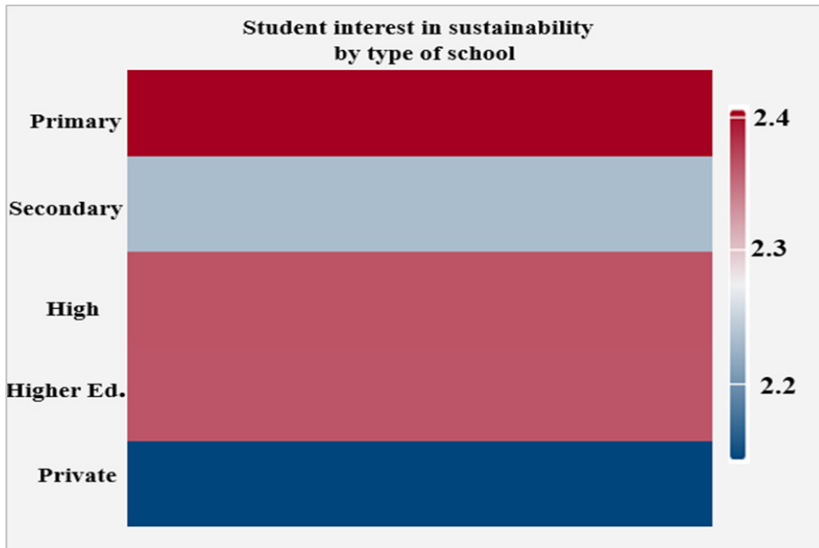
Figure 3. Heat map illustrating the mean student interest in sustainability by type of school